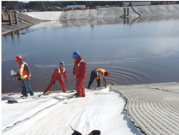
Figure 3: Installation of Fabriform concrete lining

The complexity with this design was in the excavation of wedges in the pond slopes under the structured. These wedges needed to be cut, the liner installed, the concrete structure poured, and then the slope rebuilt to match the grade of the rest of the pond. Although the slopes of the pond were designed at a comfortable 3:1 (H:V), the slopes of the wedge excavations 1:1 and included many angles and corners which greatly complicated the installation of the liner.