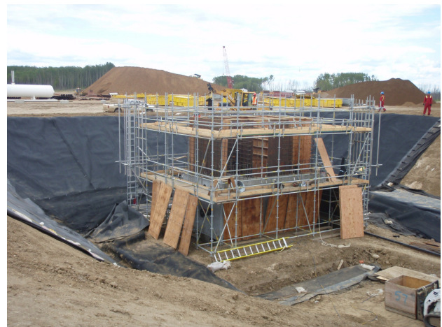
Figure 1: Liner installed under/behind Supernatant Sump

The containments at the Leismer Commercial Demonstration Plant were constructed between September 2008 and August 2009. There were four containments constructed during this period, the tank farm area, the storm water pond, the lime sludge pond and the warm lime softener tank spill containment.