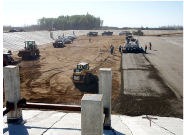
Figure 4: Installation of RCC

of the pond. Once in the pond the trucks backed up in a straight line to the concrete placement machine without making any turns on the liner.