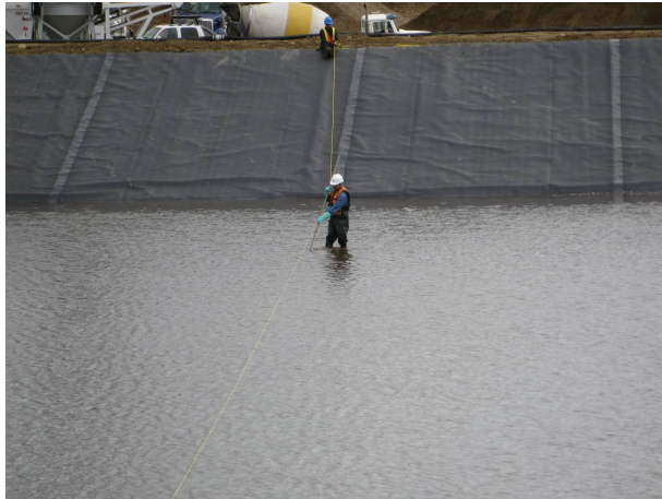
Figure 2: Leak Location Survey

The electrical leak location method impresses an electrical voltage between the contents of the pond and the earth surrounding the pond. The plastic geomembrane acts as a dielectric insulator between these two media. A leak shows up as a flow of current from the pond contents to the earth and is detected by a mobile probe. This method shows discontinuities in the geomembrane which could potentially be leaks. Not all discontinuities detected are leak paths (a carbon agglomeration in the sheet could create a non-leaking electrical path) but all discontinuities found are repaired.